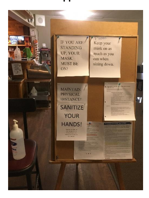
Will it look like this next year, or will it be something

If anyone has a crystal ball, we would love to have a look at it. Given the vaccine rollouts, the rapidly mutating virus and what is certain to be some global economic fallout as factors to consider in planning for next year, your Board of Directors have a challenging task in front of them.